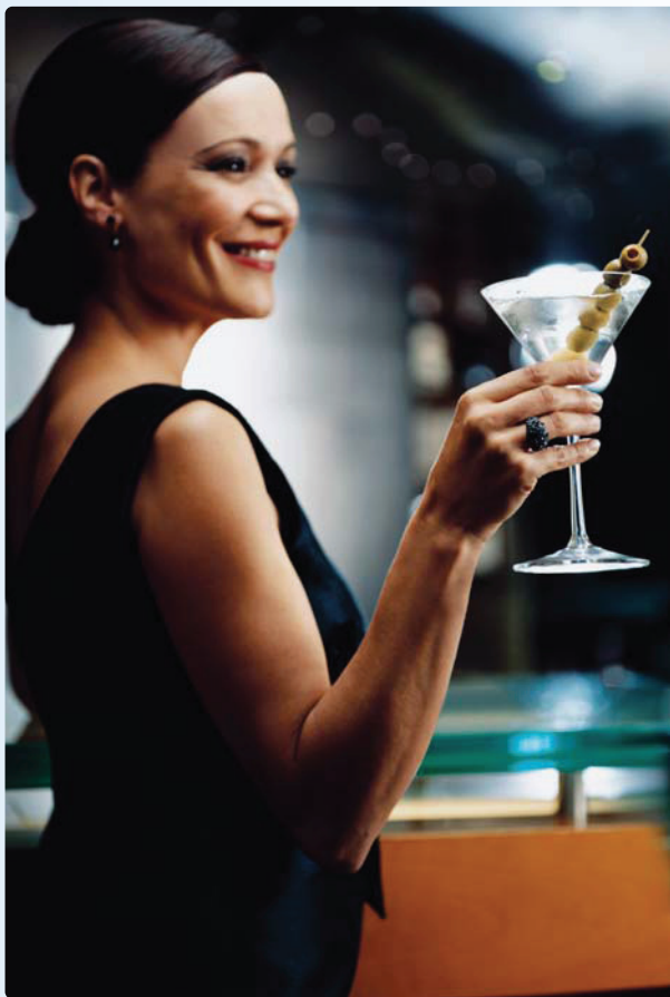
Above: Dressed for an evening to remember. Celebrity Cruises brings back the traditions of the bygone era of cruising. Offering up to three formal nights, depending on the length of your cruise.

Tuxedo rentals are available onboard. Call 800-551-5091 for more information.