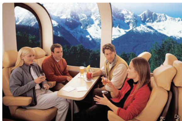
Above: Enjoying the view onboard the luxurious glass-domed Wilderness Express.

Booking window ends 12/1/08 — OPTION CODE MYU5 For full terms and conditions visit celebritycruises.com/promotions .