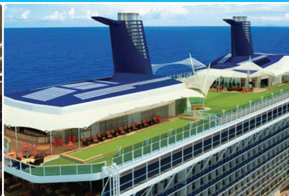
Above: Afternoon sunshine illuminates the extensive Shops on the Boulevard; The Lawn Club Shop on the new Solstice Class of ships.