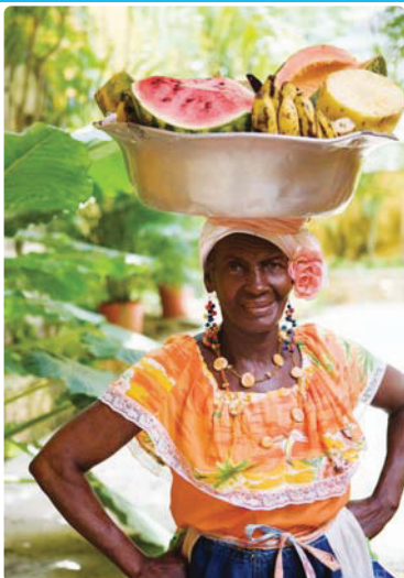
Above: Balancing a bountiful fruit basket on her head, a palenquera offers salads and juices for sale.

Cartagena, Colombia, embraces visitors with its warmth and diverse beauty. And if you're like most, you'll want to visit again and again. This destination is just one of the many to which we travel!