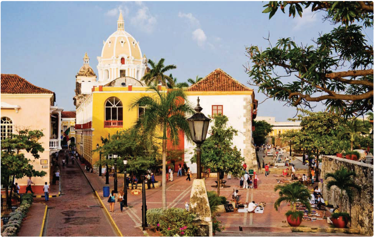
Above: Plaza Santa Teresa, Cartagena, Colombia, South America.