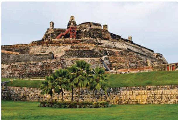
Above: Castillo de San Felipe de Barajas Cartagena, Colombia.

15 Night Celebrity Infinity Westbound Panama Canal cruise, Spring 2009 & 2010