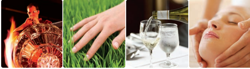
Above left: Hand-blown glass at the Hot Glass Show; the fresh grass of The Lawn Club; an outstanding wine selection; a soothing massage in the AquaSpa.

All images of Celebrity Solstice are artistic renderings and reflect the proposed design and layout. Design and layout subject to change without notice.