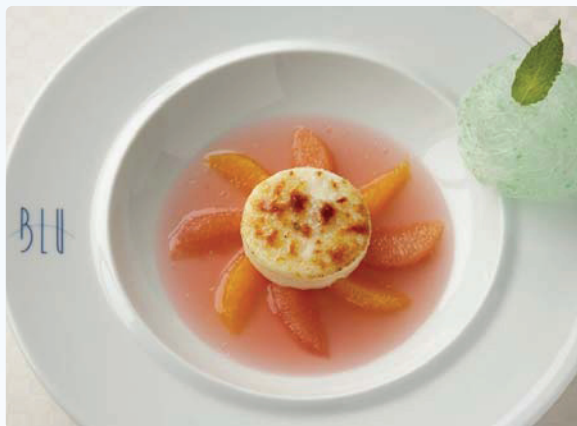
Above: A delicious citrus dessert served in the specialty restaurant Blu, onboard the new Celebrity Solstice Class.

Upon arrival you'll receive a welcome packet that includes a teeth-whitening sample, slippers, and a spa kit filled with amenities. Within your stateroom's spacious bathroom you'll find an invigorating Hansgrohe ® shower tower, plus oversized bath and face towels and plush robes and slippers. Then customize your environment, with light dimmers, ambient sounds, and aromatic infusions.