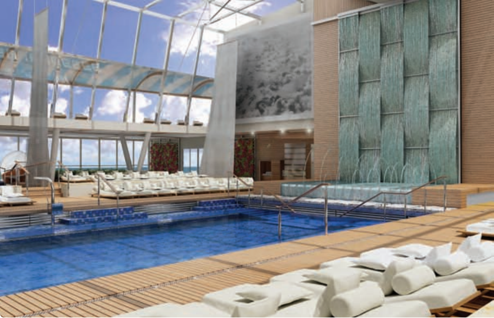
Left page: Blu restaurant. Above: The modern brilliance of the Solarium.