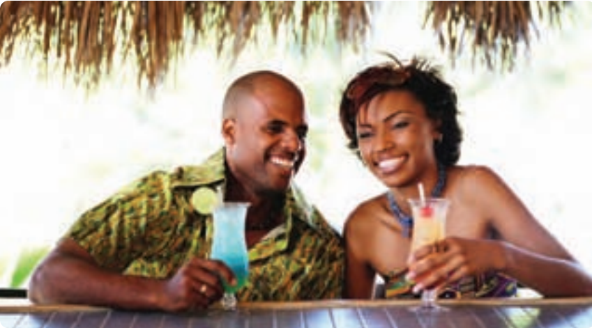
A vividly colored parrot paints the landscape; amazing sunsets light up the sky; island-time refreshments; Long Bay on Tortola, British Virgin Islands.

waters, while beneath the surface a kaleidoscope of vivid blue tang and angelfish dart in and out of vibrant coral reefs in places like Tortola and Aruba.