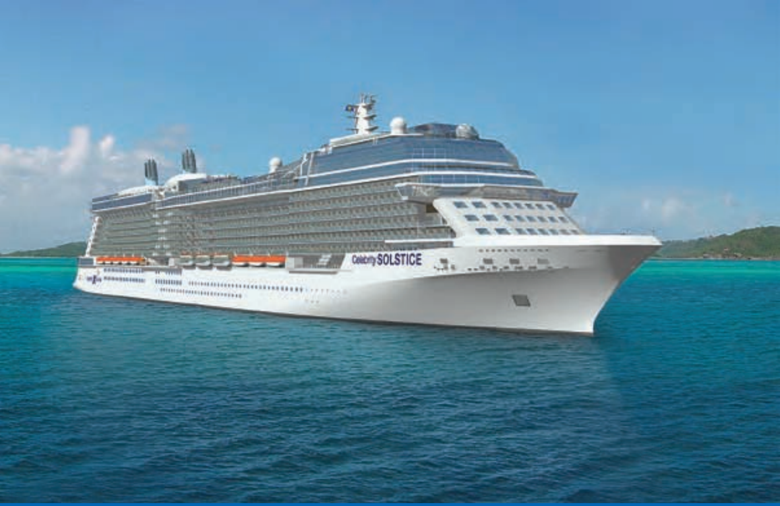
Left page: The AquaSpa®; fresh, contemporary spa treatment room; beautiful details of Blu. Above: Celebrity Solstice: setting sail December, 2008.