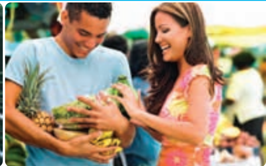
Swimming with dolphins; taking in the view on the skybridge in Costa Rica; taking in the flavors of the islands.