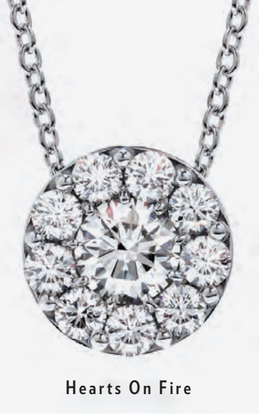
Hearts On Fire