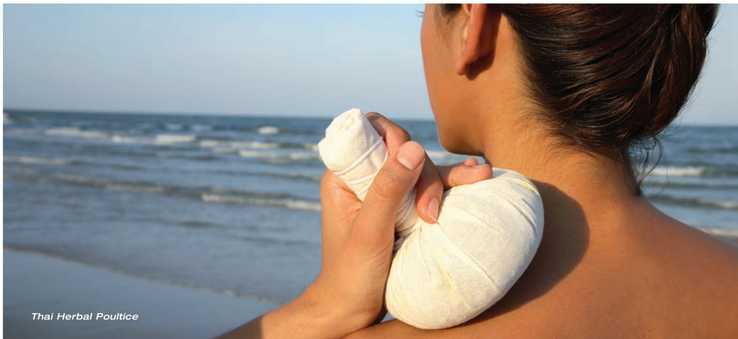
Thai Herbal Poultice